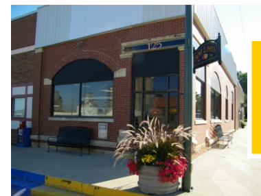
Sole 2 Soul Fitness Center