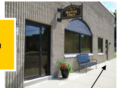
The Meeting Place